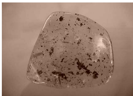
Fig. 1: A typical piece of Baltic amber employed in these experiments