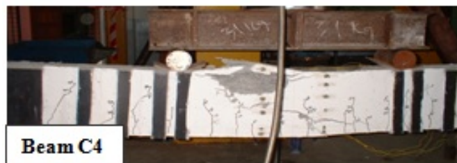
Plate 1: Failure mode of tested specimens