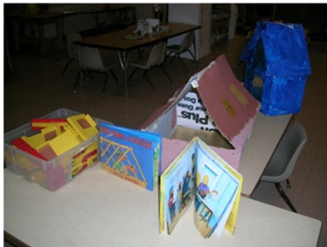
Fig. 4: Children were interested in building houses.

Through negotiations, documentation and 'listening' carefully to the preschoolers, the teachers make decisions on what would be next in terms of the new pathway of the curriculum in general and how to shape the environment. Teachers made a careful selection of materials and tools, and prepared the environment where the preschoolers could explore and interact with literacy materials (including toys and books). Along with a thoughtful selection of materials, the teachers paid much attention to how materials would be presented to create learning possibilities for the preschoolers. They aimed to provoke children's interest in reading and writing by providing materials and tools and a chance to explore them freely in a comfortable place (see Figure 4). Teachers co-created the essential qualities of the space with the children. Not the curriculum but the environment, which was enriched with literacy materials and tools, was provocation to interests of the preschoolers in literacy. For example, the preschoolers were interested in Bob the Builder, a cartoon character who builds houses, and the teachers enriched the environment with related literacy materials and props and gave the preschoolers time and an opportunity to work on their interest.