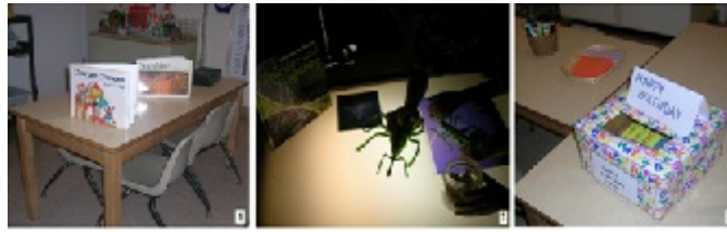
Fig. 5: Various literacy experiences: 1-Reading books and telling stories on a tape-recorder, 2-Reading books and weather maps, checking transparent pictures, 3-Making a message box, and writing happy birthday messages to a friend in the class.