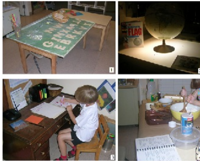
Fig. 2: Emergent Literacy was co-constructed at multiple places at multiple times: 1- Main classroom: Tracing wooden letters and using pipe-cleaners to make letters and numbers, 2- Art studio: Reading books about countries and flags and painting on the light table, 3- Main Classroom: Writing letters, 4- Kitchen: Making a banana bread from the recipe book.