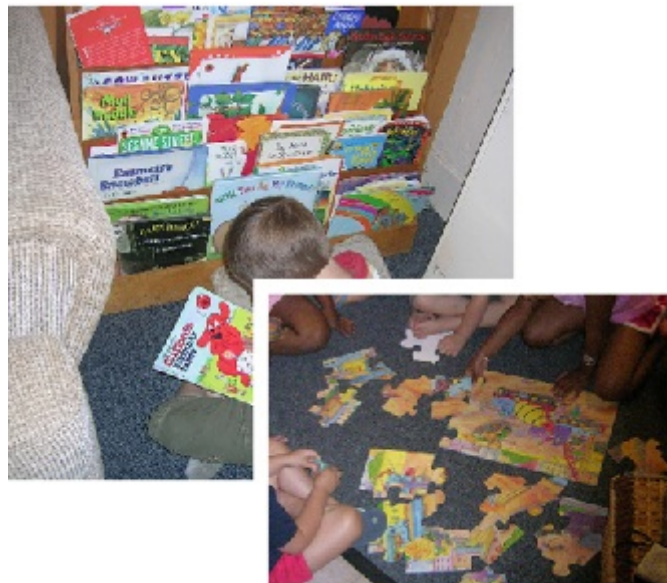
Fig. 6: Environment accommodates both individual work and group work.

The space is thoughtfully organized to foster social exchanges and interactions between the things and the people, and to provide spaces where children can stay alone if they want (see Figure 6).